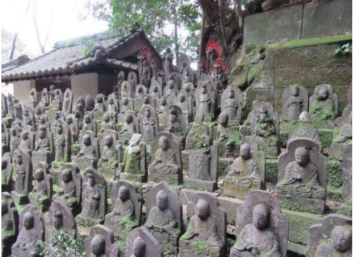
Collection of Stone Buddhist Images