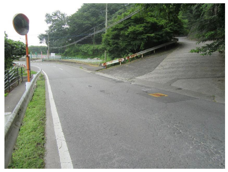
Here, take the branch road which goes up the hill.