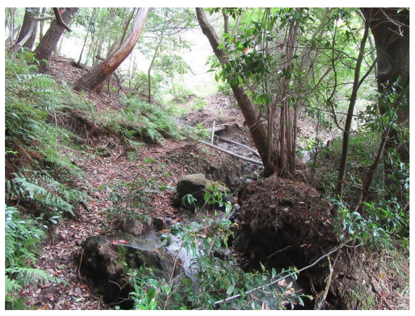
Hot Spring Water Stream