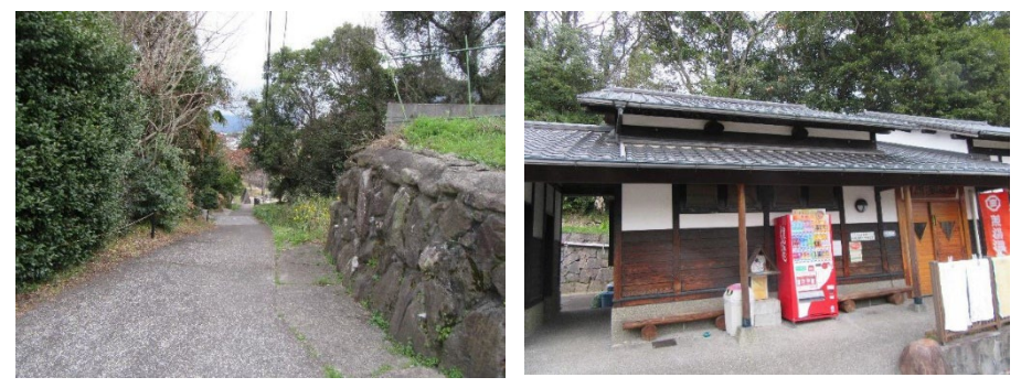
Slope Leading Down to Teruyu Onsen

developed about 180 years ago by a feudal lord of Kusu, which is in the western part of Oita Prefecture.